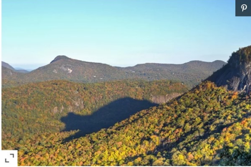
emThe Shadow of the Bear./em

A spectacular, not-to-be missed natural phenomenon in Jackson County, North Carolina is the "Shadow of the Bear." During the last two weeks of October, when the sun sets behind Whiteside Mountain, its shadow creates a perfect image of a Black Bear that dances across the tops of the colorful trees.