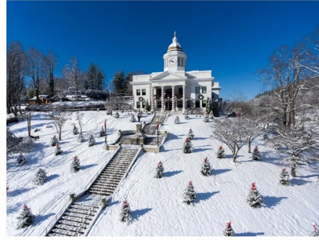
FORMER COURTHOUSE IN SYLVA