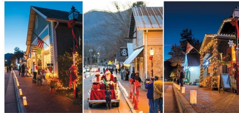
During Dillsboro's annual Lights & Luminaries event, more than 3,500 candle paper bags line the streets, bathing the storefronts in a warm glow.

A longtime local crafter is proud of her tiny town for its shops, restaurants, and abundance of Christmas spirit.